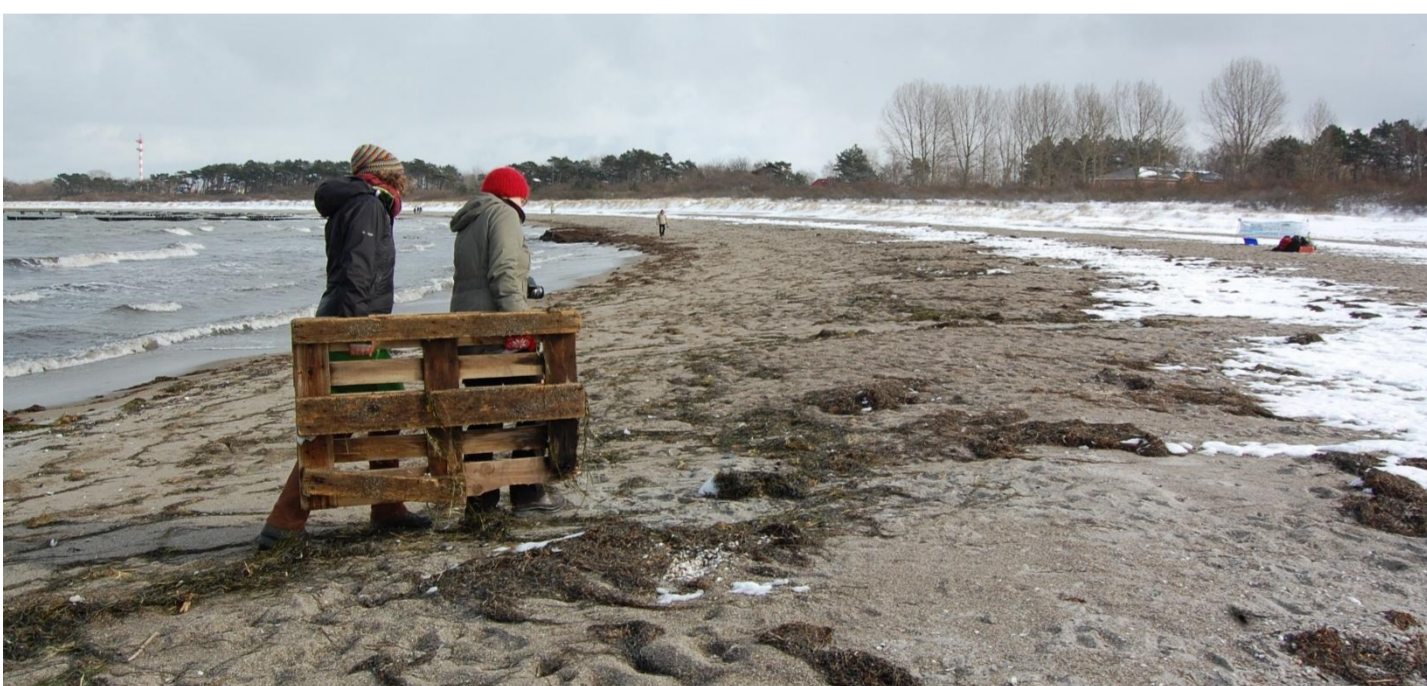
Beach cleanup in Rostock in March 2013

EUCC-Germany organises beach cleanups along beaches and riverbanks. With the cleanups EUCC-Germany actively contributes to the protection of the environment and raises awareness of the general public on marine litter issues.